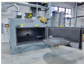
Table Blast Machines