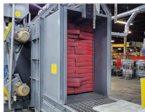
Pass-Thru Blast Machines