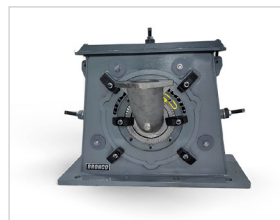
UDD Blast Wheel